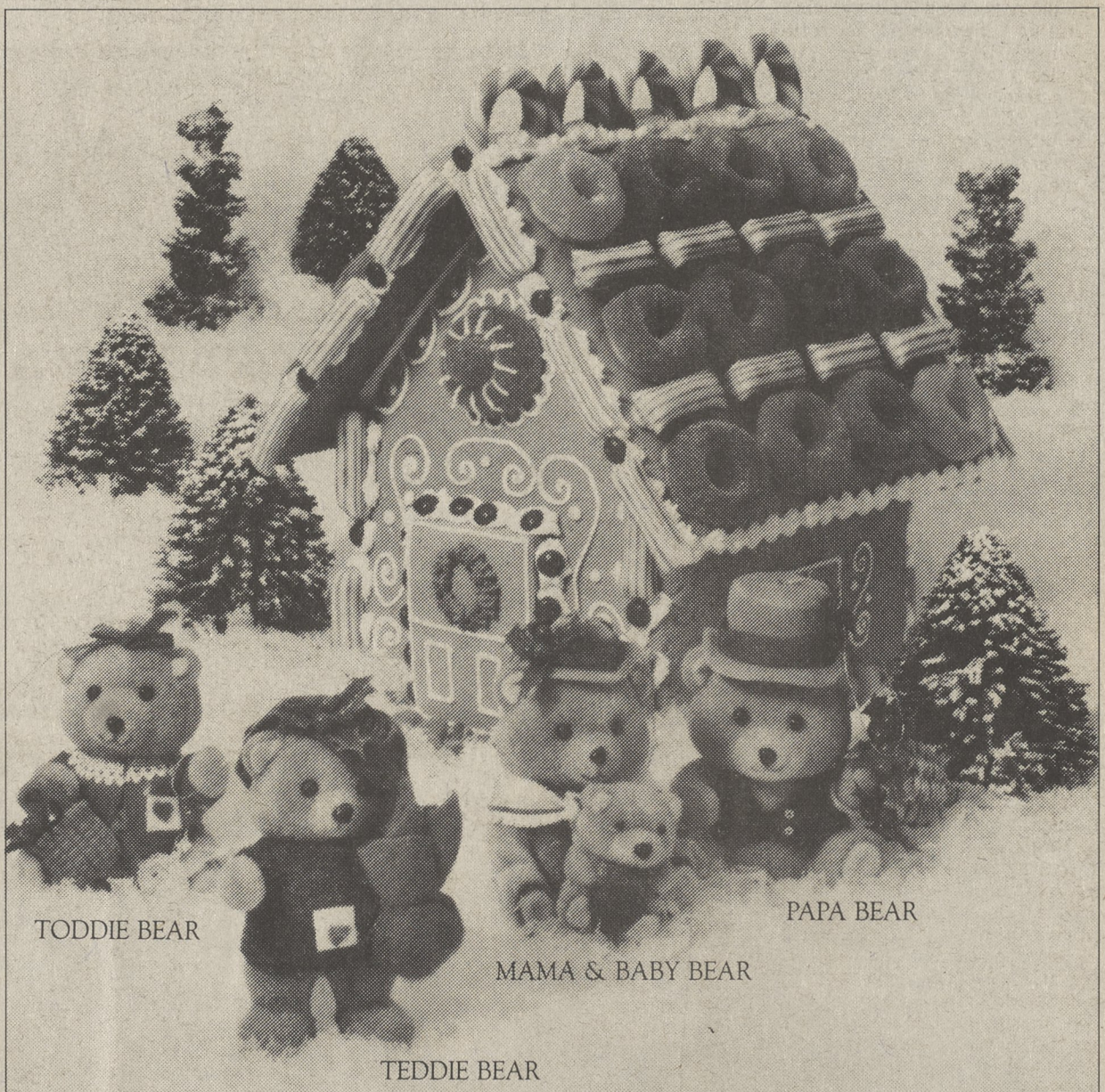
TODDIE BEAR PAPA BEAR MAMA & BABY BEAR TEDDIE BEAR