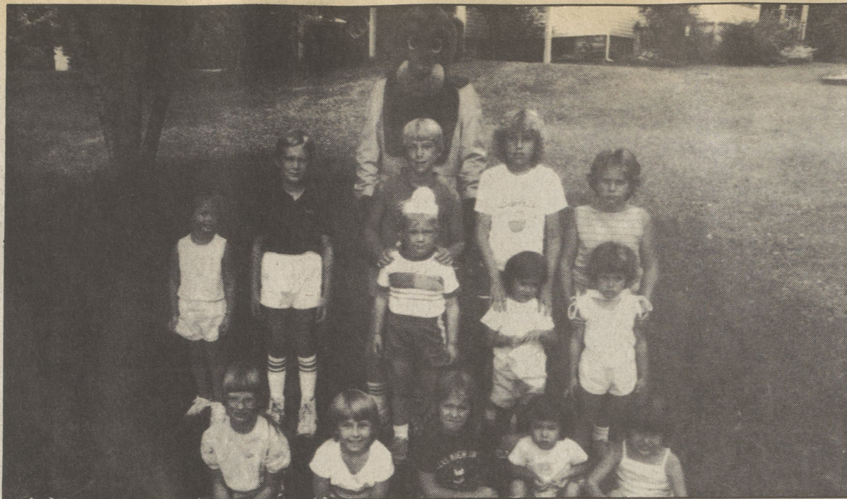
Safety Day group

In fiscal year 1984-85, the two academies trained 668 state and 382 county employees, for a combined total of 86 weeks of basic training.