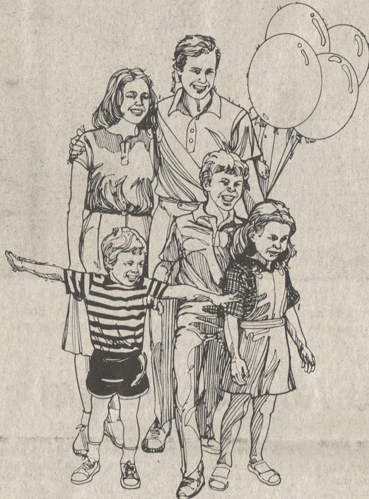
Sponsored By The Following Businesses: