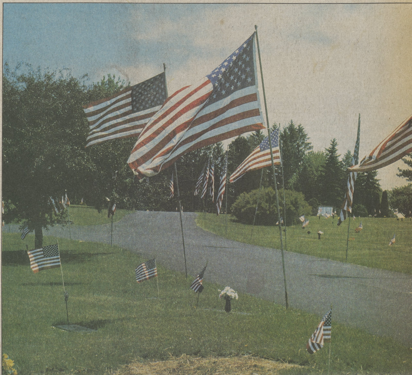
Avenue of Flags

DALLAS BOROUGH candidates are running on the Republican (See ELECT, page 8)