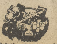
The Most Famous Basket in the World

Our Hostess' Gifts and Information are the Key to Your New Community Call 675-2070