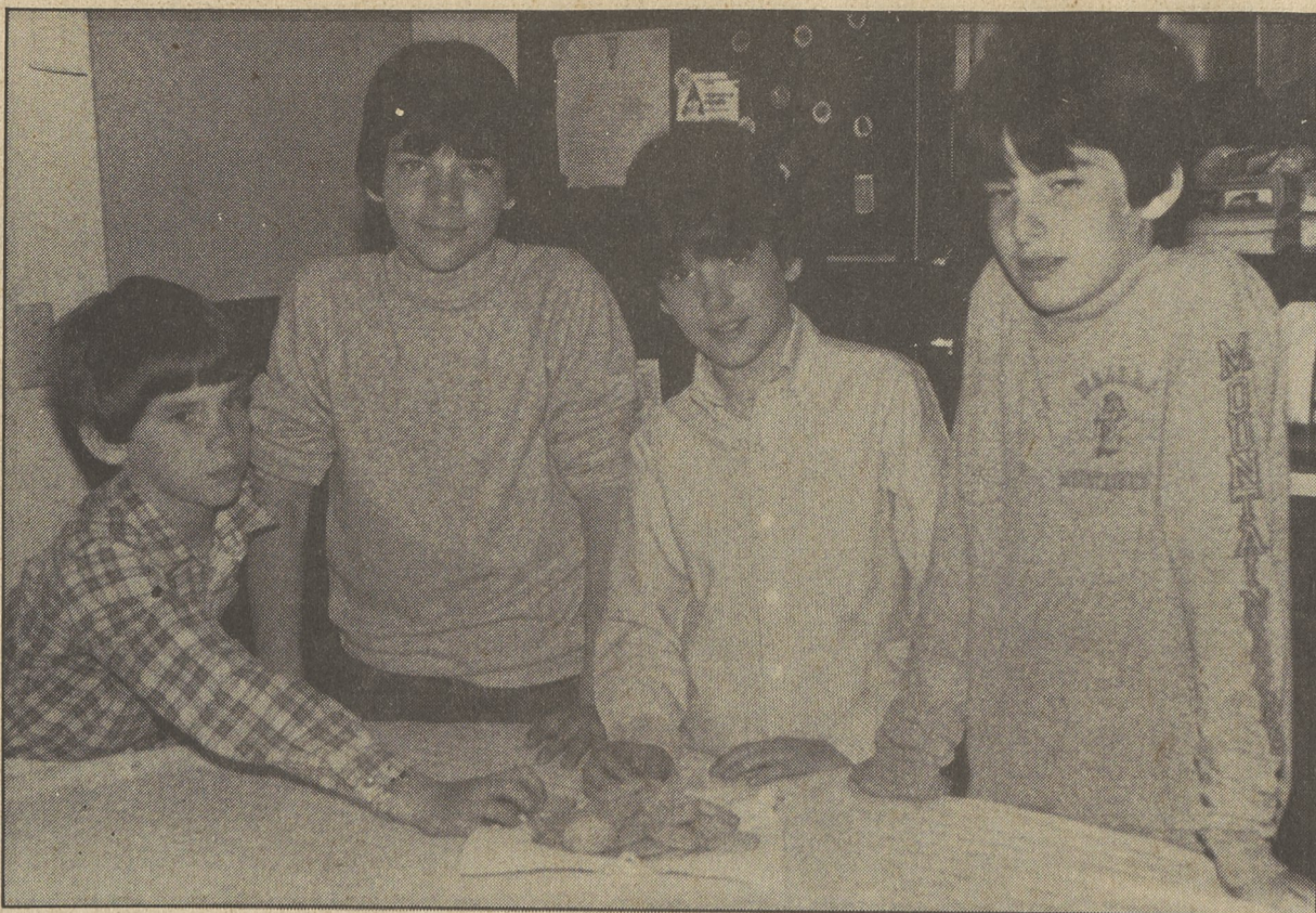
Dallas Post/Charlot M. Denmon

In large bowl of electric mixer, mix one cup flour, sugar, two teaspoons salt and yeast. Gradually add water and two tablespoons oil.