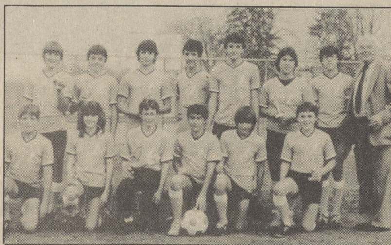
BACK MOUNTAIN COSMOS