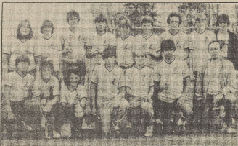
BACK MOUNTAIN ROWDIES