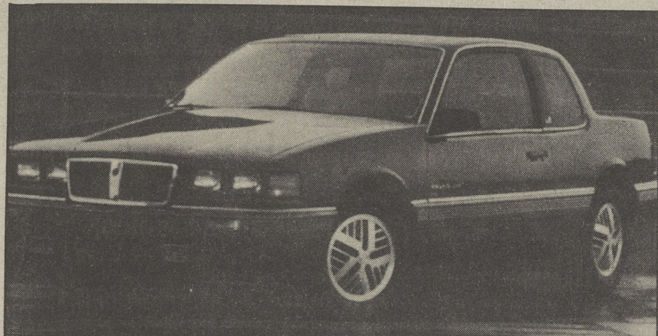
The 1985 Grand Am is a brilliant new driver's coupe from Pontiac. It is the