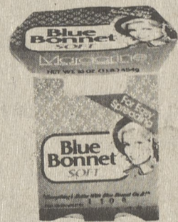
Soft BLUE BONNET® Margarine