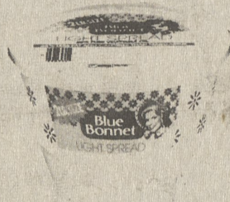
BLUE BONNET® Spread