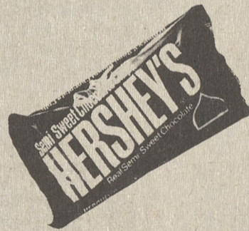
HERSHEY'S® Chocolate Chips