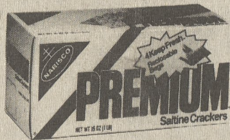
PREMIUM Saltine Crackers