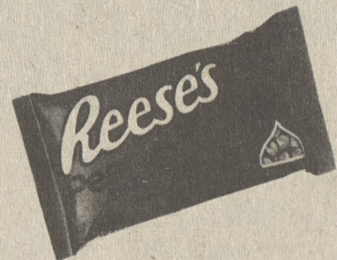
REESE'S® Naturally Flavored Peanut Butter Chips

And in cooperation with Sunbeam APPLIANCES