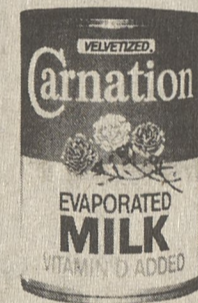
CARNATION® Evaporated Milk