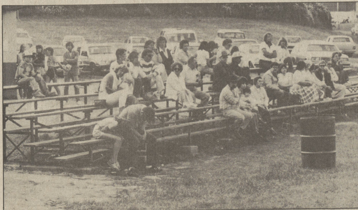
Although the bleachers may look a little sparse in this photo, there are fans at every game held at the Back Moun-