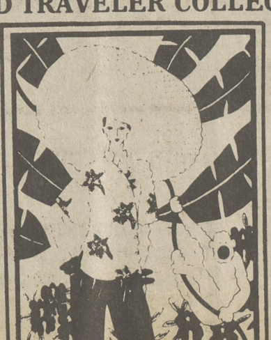
W. Northampton St. 825-2024

Announces The Opening Of His Practice For