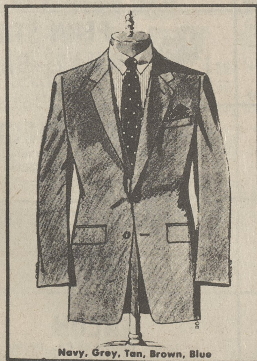
Navy, Grey, Tan, Brown, Blue

45% Wool — 55% Polyester Blend Makes It Perfect For Year