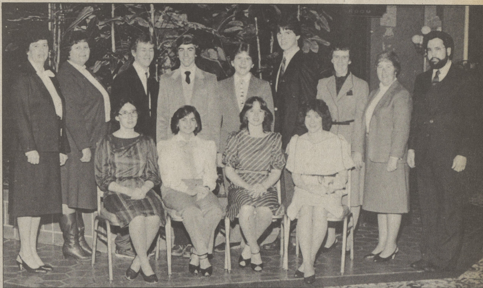
Shown here are some of the participants in the Eighth Annual Awards Banquet held recently in honor of the Dallas Senior High School Marching Band. From left,