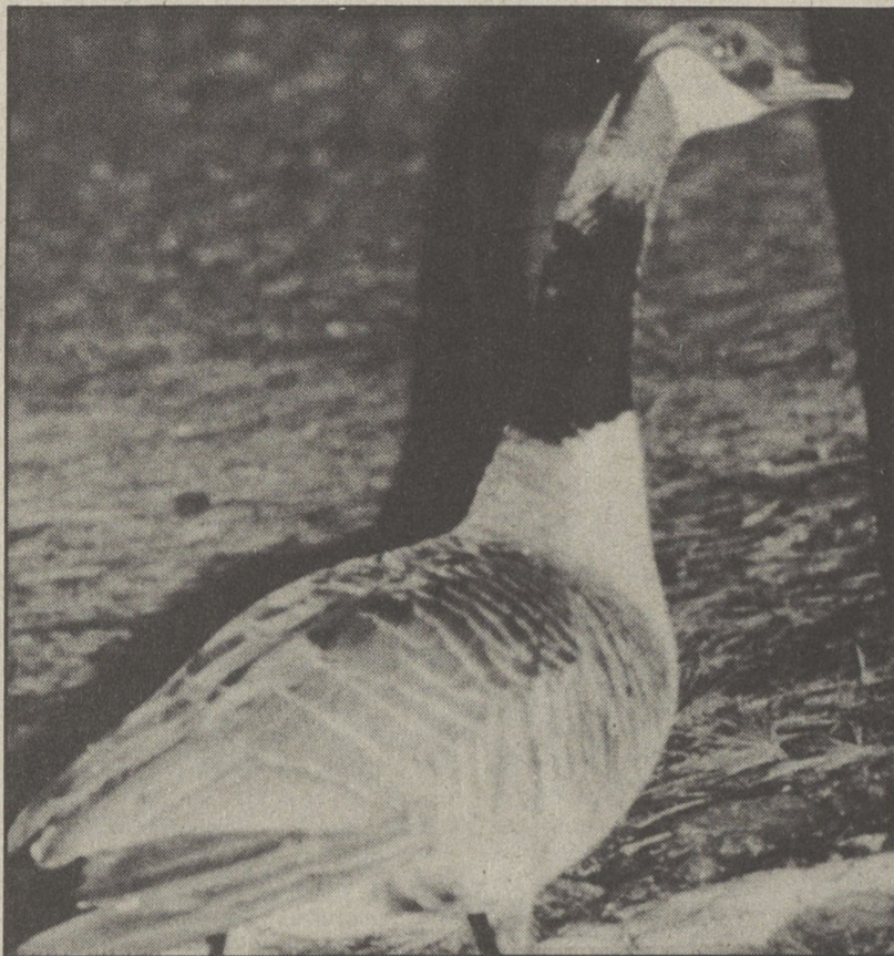
This little guy was a traffic stopper one evening last week when he was seen waddling down the road near the Lehman Trailer Court. Although he wouldn't fly, he was walking rather rapidly and the Dallas Post photographer had a hard time getting him to stand still enough to have his picture taken.