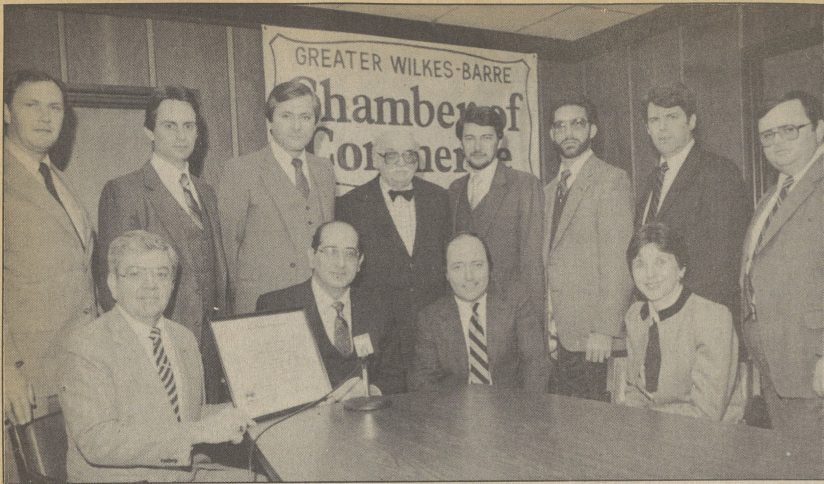
Shown here are members of the newly-designated Certified Development Committee. From