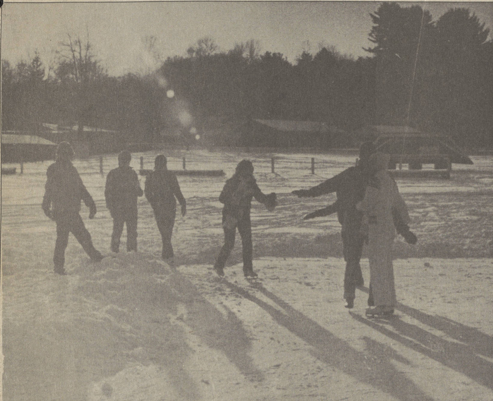
These people took advantage of the cold weather we had last week, put on their ice skates and did

some old-fashioned skating on the beach at Harveys Lake. Silhouetted in the sunlight are,