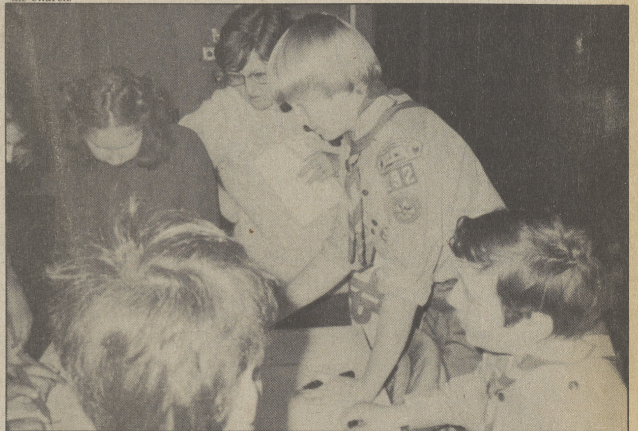
Learning to write in Chinese can be simple if someone shows you how.