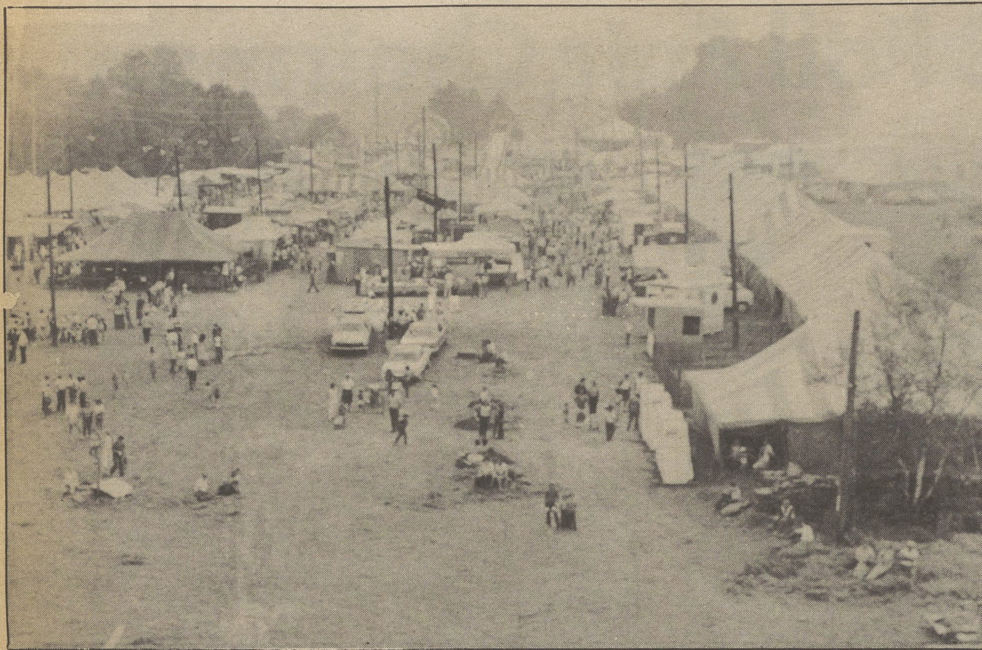
An overall view of the Luzerne County Fall Fair as it appeared in 1982 shows rides, events, refreshments and all kinds of fun.