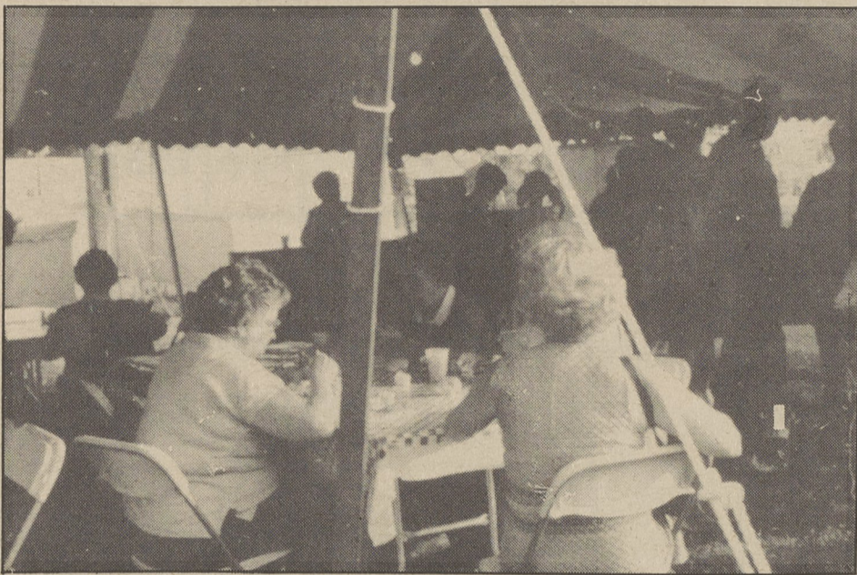
The big tents provide shelter and the food is delicious