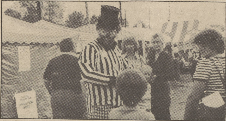
Everyone loves the clowns