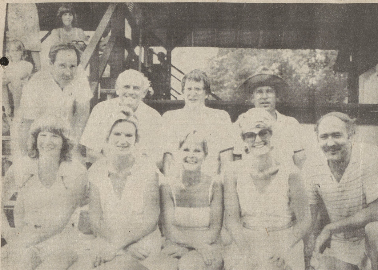
Dallas Post/Dan Walsh