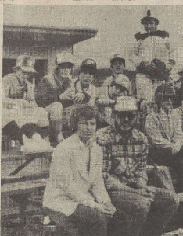
SPIRITS UNDAUNTED: A little bit of rain did nothing to stop the crowd from catching the first games of the season at Back Mountain Little League's Opening Day last Saturday. Ceremonies started early, 8 a.m. with plenty of pomp and circumstance. After that, it was all business, as the youngsters and their coaches took to the fields and battled it out.