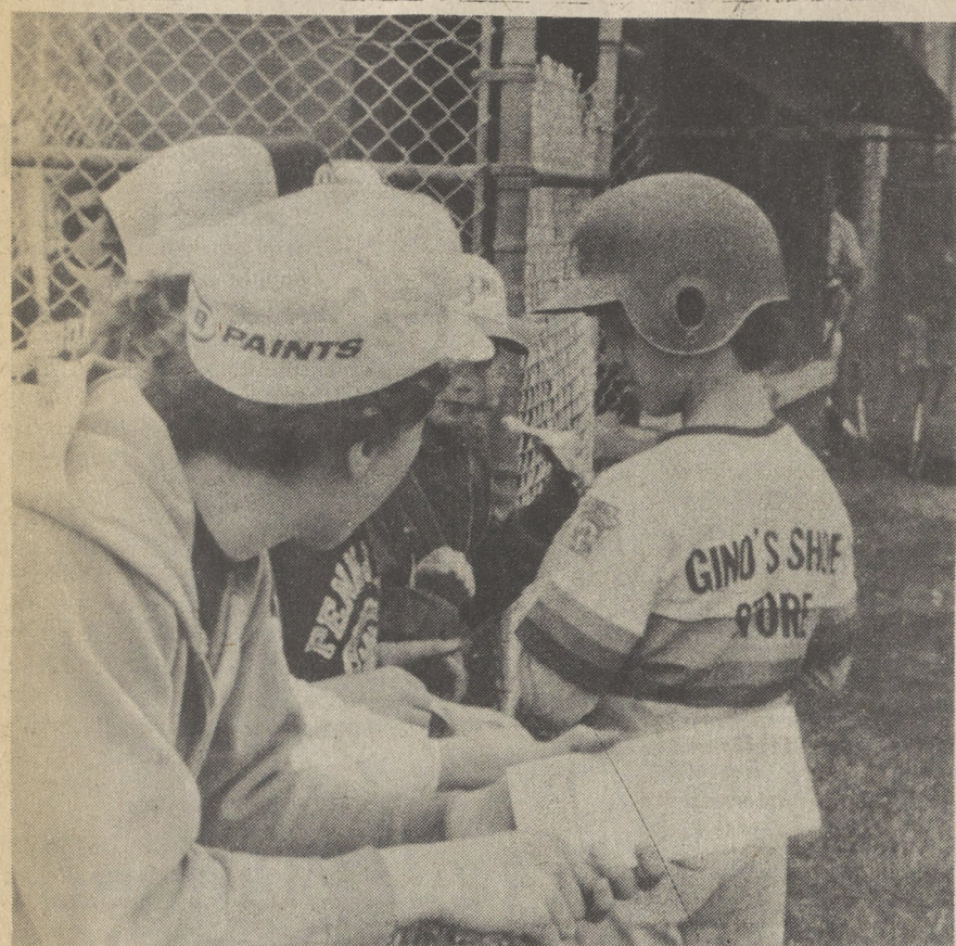
I GUESS I'M UP: Players from all the major league and softball teams exhibited a bit of nervousness before taking to the field on Saturday. But, when it was all said and done, there was a general feeling of having done a good day's work out there.