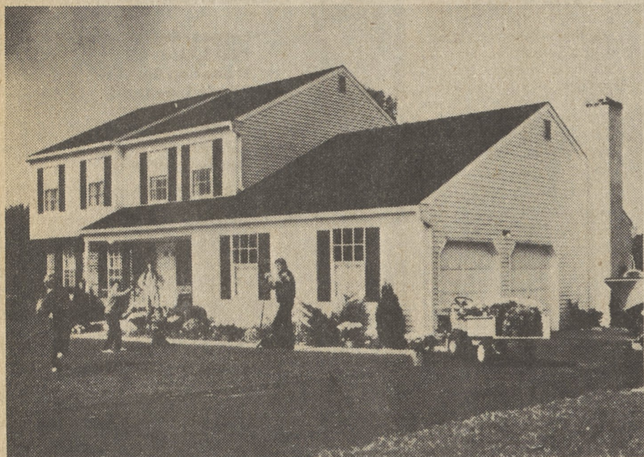
ONE OF THE BEST HOME IMPROVEMENT INVESTMENTS can be the addition of durable solid vinyl siding from CertainTeed Corporation. The product comes with a 50 year limited, non-prorated warranty, offering the homeowner years of virtually maintenance-free living at a very low cost per year of service.