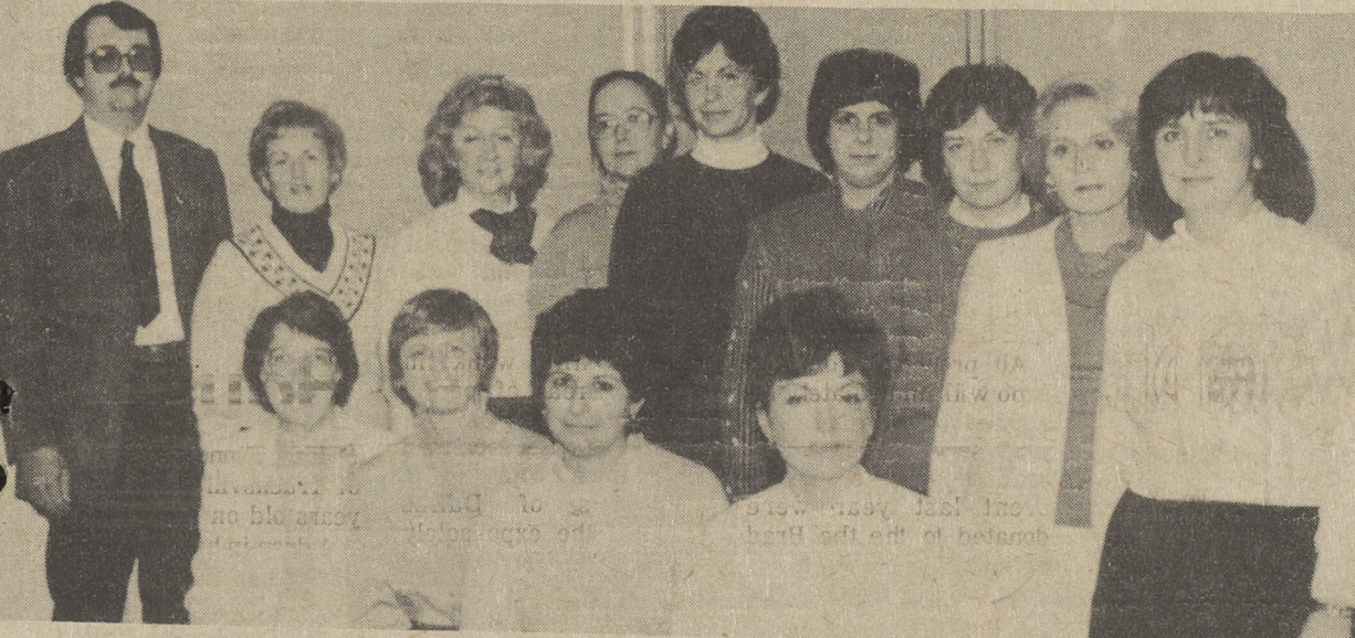
TALENT AUCTION -Wyoming Seminary will hold its 10th Annual Talent Auction on Saturday, April 30, at 5 p.m. in the Pettebone-Dickson Student Center, Maple Avenue, Kingston. The auction which attracts hundreds of alumni, parents, students, faculty and friends of Wyoming Seminary features handicrafts, food specialties, paintings, services, dinners, entertainment,

9 W. Northampton St., Wilkes-Barre 825-2024 HOURS: 10:00 to 5:00 Daily