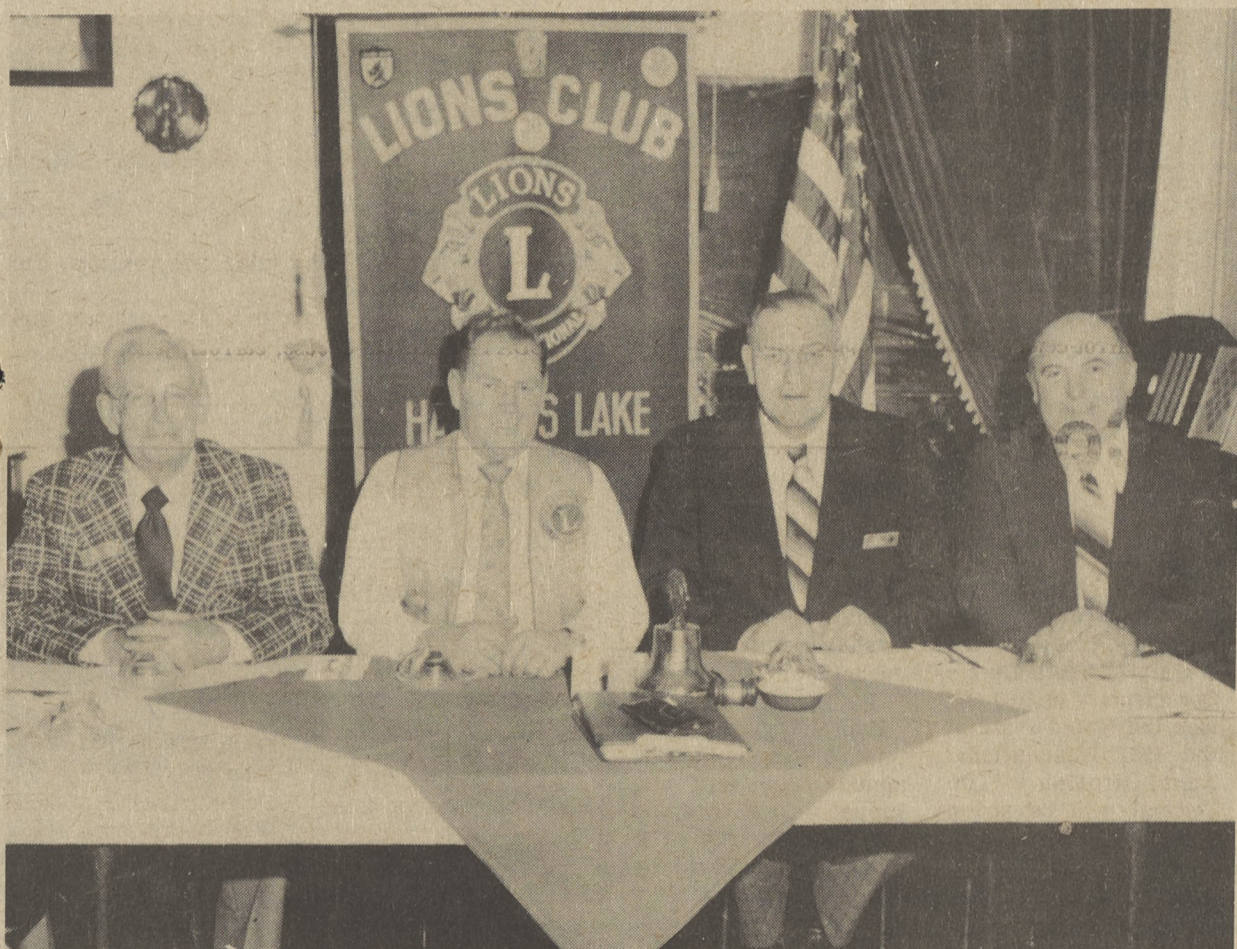
PANCAKES AND SAUSAGE : The Harveys Lake Lions will hold their annual Pancake and Sausage Supper and Breakfast, at the Lake-Noxen Elementary School, Harveys Lake, on Saturday, March 26, 5 to 8 p.m., and Sunday, March 27, 9 a.m. to 1 p.m. Chairman of the affair