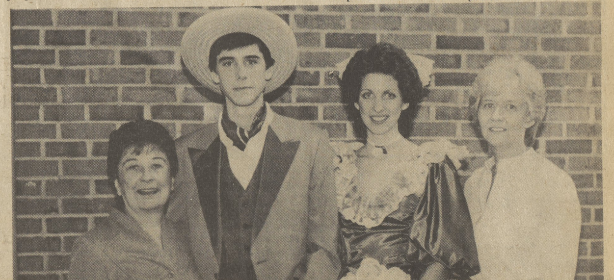
HAPPY BIRTHDAY —College Misericordia recently held a southern celebration in honor of Robert E. Lee's birthday. College seniors, administrators, and faculty joined in the festivities. Southern food, such as southern fried chicken, baked Virginia ham, pecan pie, "goober"