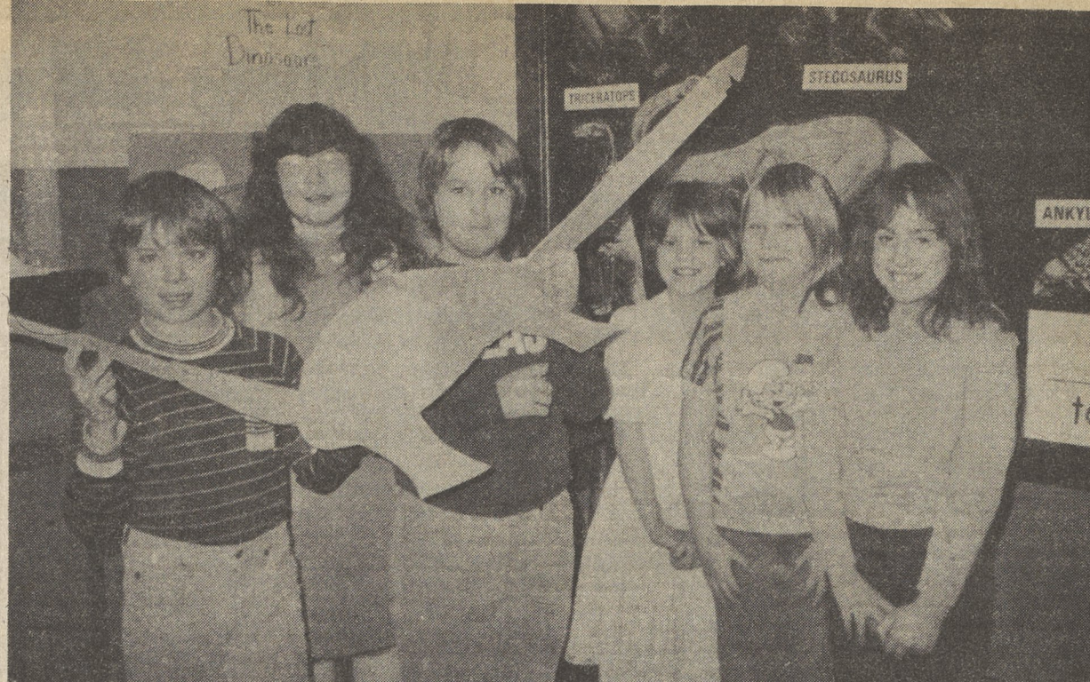
A TRIP INTO THE PAST—Truckville Elementary fourth graders enjoy their study of prehistoric animals. The students use props of all kinds to make the subject matter come to life. Seen holding a large paper dinosaur