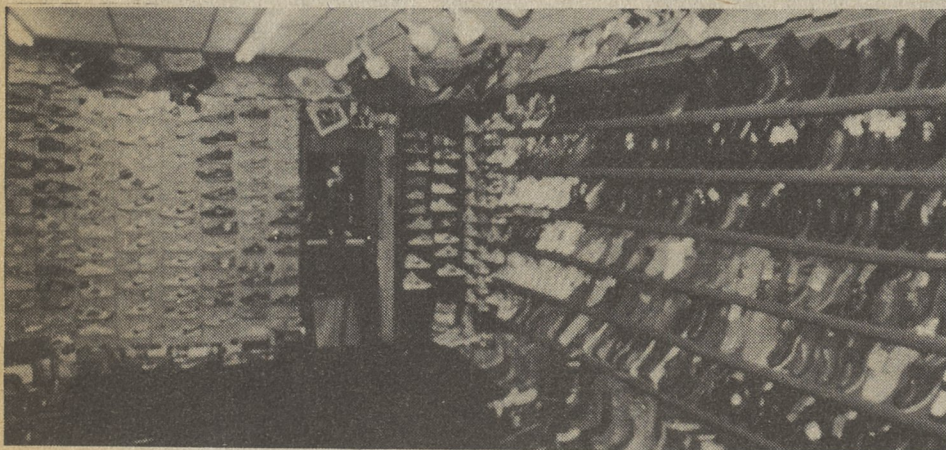
JAY-DEE SHOES & CLOTHING