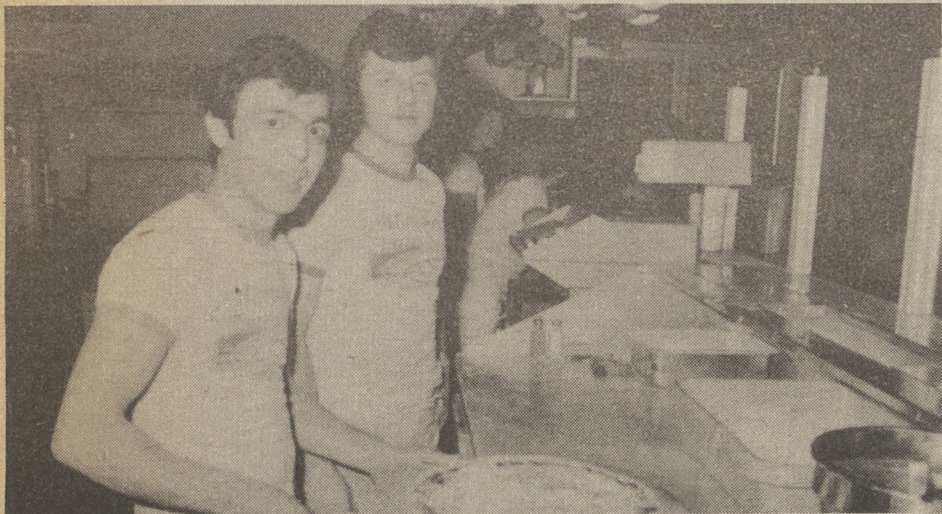
MIMMO'S PIZZA & RESTAURANT