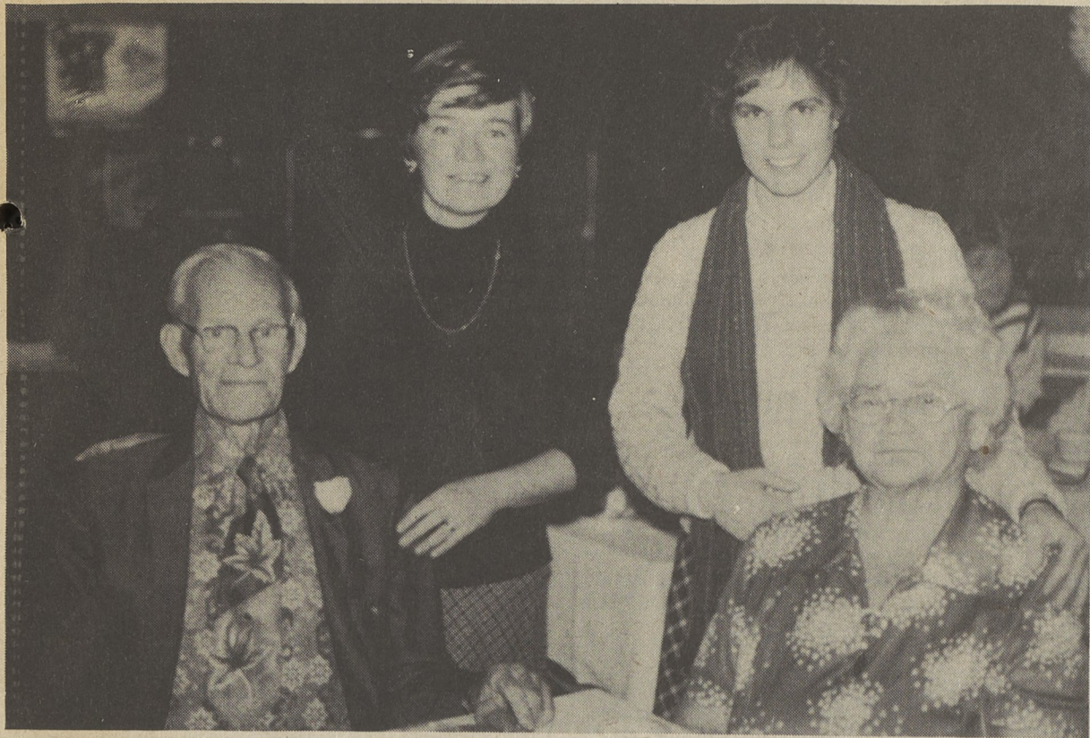
ADOPT-A-GRANDPARENT PARTY —College Misericordia Adopt-a-Grandparent program, sponsored and coordinated through the College's Campus Ministry program, recently held their Adopt-a-Grandparent Christmas Party on the Back Mountain campus. Grandparents adopted by Misericordia students were invited to the campus to take part in a dinner, session on making