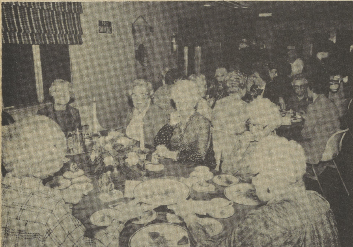
CHRISTMAS TEA—Everyone in attendance enjoyed the holiday atmosphere, entertainment by the Meadowlarks and visiting the Country Store at Trinity Presbyterian Church's Christmas Tea.

Twenty beautifully decorated tea tables, resplendent with fine chinas and linens, with unique table decorations reflecting the personality of their hostesses greeted the 160 ladies who attended the Christmas Tea at Trinity Presbyterian Church recently.