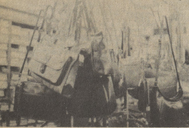
All Leather Bags by Borelli