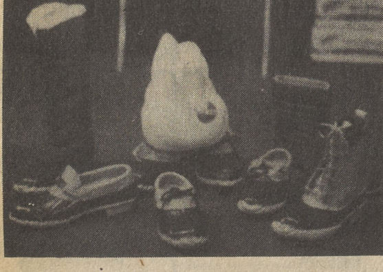
Join the "In" Crowd Buy SPORTO

Men, Women & Children All Shoes Discounted