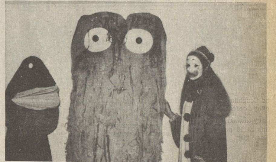
HALLOWEEN CREATURES --'Tis the season of spooks, witches, pumpkins, black cats, goblins, and Halloween Costumes again! If you like parties-and to dress up-plan to attend the second annual Halloween Costume Party at The Children's Museum, 1710 Wyoming Ave., Forty Fort, on Sunday, Oct. 31 between 1 and 4 p.m. There will be movies, playtime, refreshments, and bobbing for apples! The characters in this picture will be there and we will see you there.