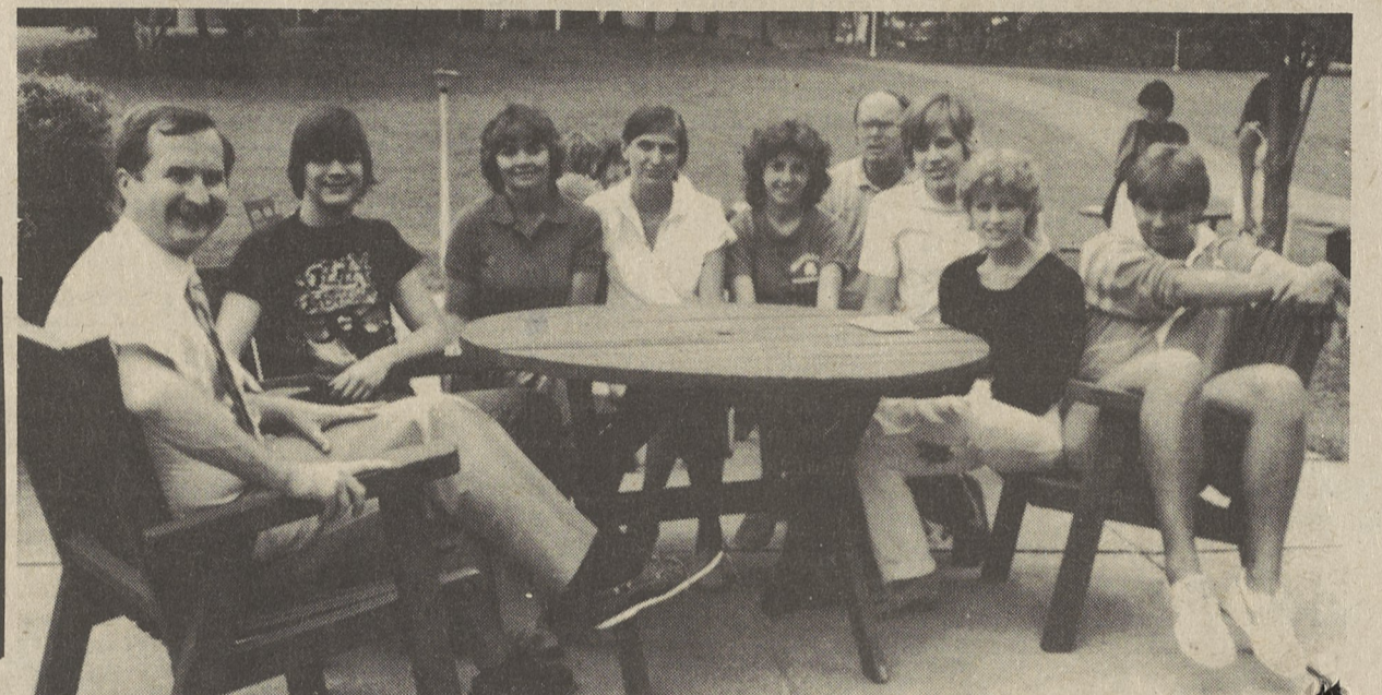
SUMMER PROGRAM —More than 35 students participated in College Misericordia's Learning Assistance Center Summer Program. The four week series of workshops and mini-courses came to a close as the college's annual orientation began. The students were offered mini-courses in The Russian Revolution, Creative Problem Solving, and Video Communications. Work-