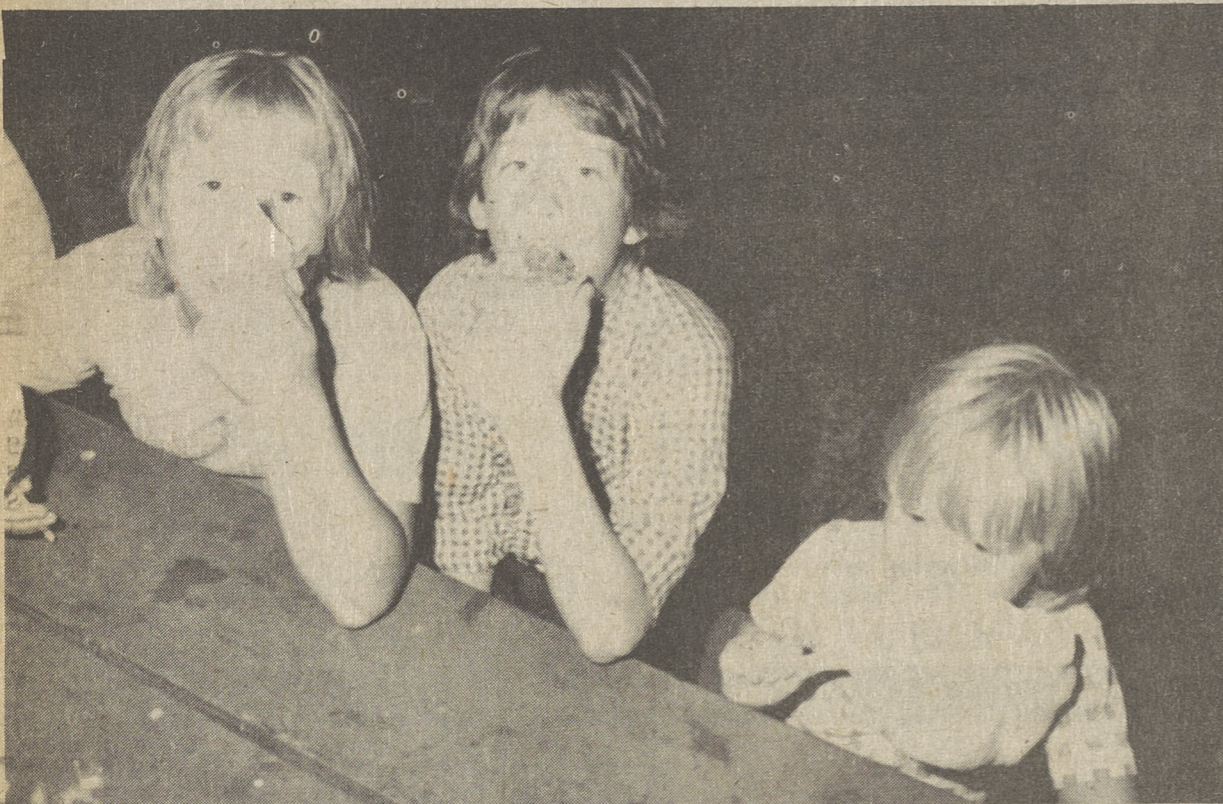
FOOD FOR THOUGHT-Not on this occasion. It's food to satisfy the appetites of these youngsters at last week's Harveys Lake Fireman's Bazaar. Pizza, hot dogs, ice

As an added attraction this year the Luzerne County Drill Team will hold the opening ceremonies both days of the show.