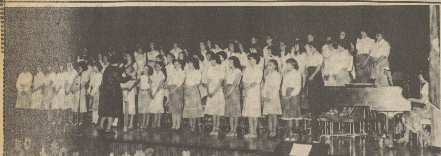
JUNIOR HIGH CHORUS —Members of the Dallas Junior High School Chorus presented their annual spring concert last week in the high school auditorium. More than 70 girls sang selections from "The Sounds of Music", and numerous Broadway numbers.