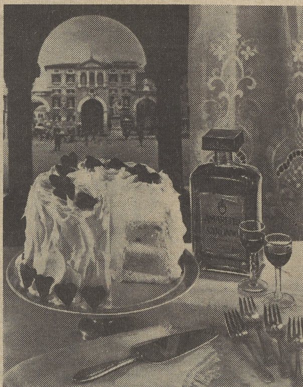
DELIGHT THE BRIDE-TO-BE with this scrumptious Saronno Shower Cake. A splash of Amaretto di Saronno, a taste of the Renaissance, gives it an intriguing flavor.

Cut ice cream into slices and place pistachio ice cream on bottom layer.