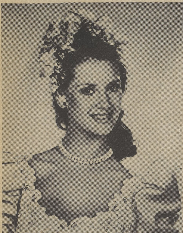
A TWO-STRAND DOG COLLAR of 6mm cultured pearls gracefully matches the elegance of this Priscilla of Boston gown. Necklace and earrings from the Cultured Pearl Association of America and Japan.