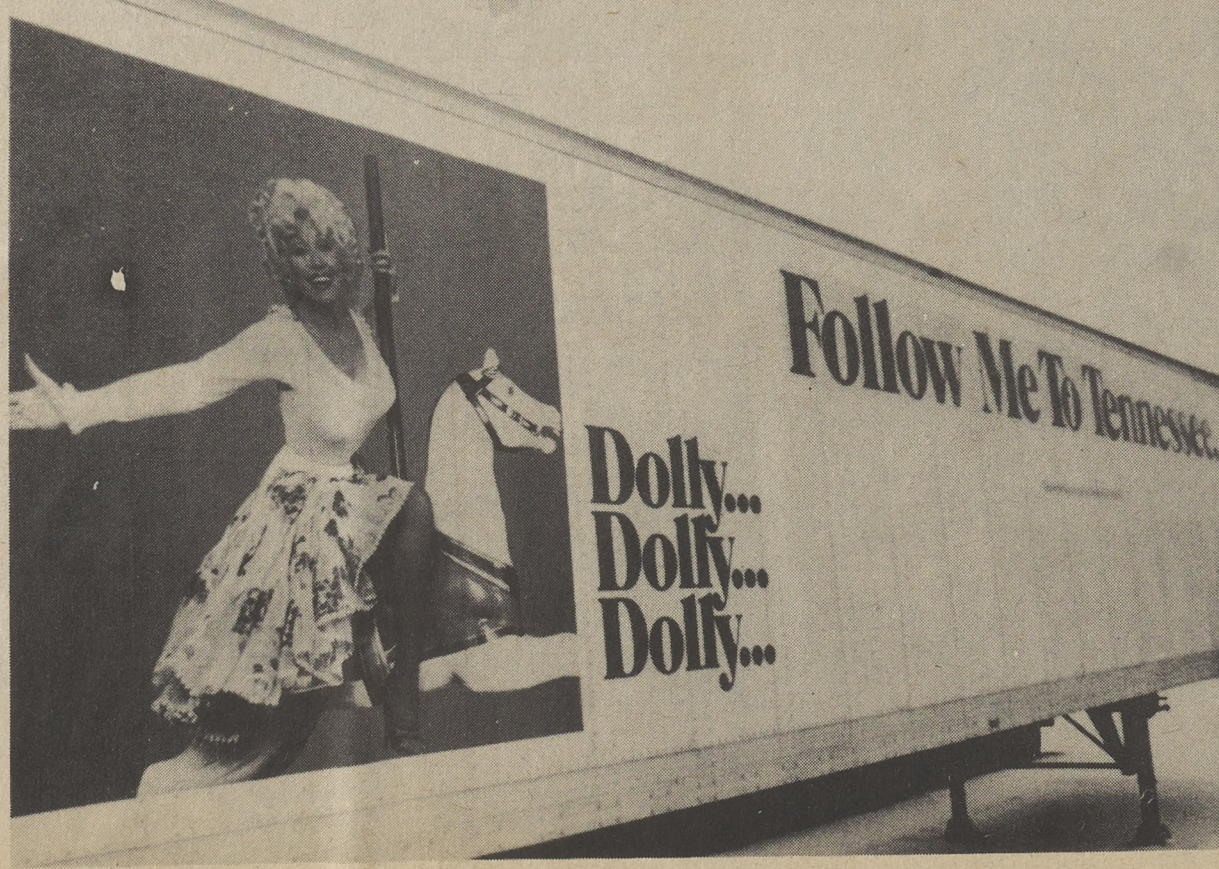
A TRACTOR-TRAILER with the above message has vertron Road, Trucksville. (Paul Strasser took the photo, been parked off-and-on for the past few weeks on Car- so all you guys out there with murder in your hearts...)

You could get--Chickens 28c lb.; turkeys 45c lb.; potatoes 20-lb. bag 99c; instant coffee 10-oz. jar 99c.