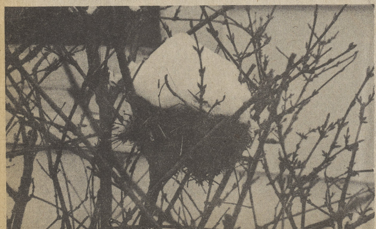
The birds flew south and old man winter moved in.