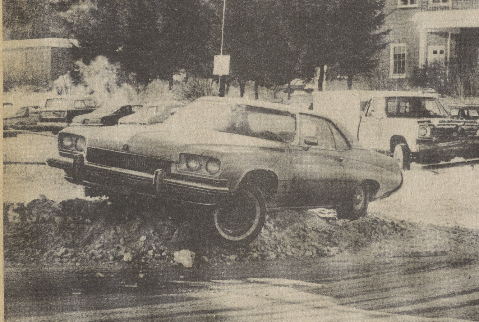
We don't know how it got there either. - but it was at Fino's Pharmacy Monday morning.