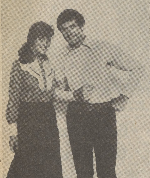
SHIRTS GO WESTERN FOR HOLIDAY—Wrangler western shirts for him and her are perfect choices for holiday gift-giving. Left: For her, an authentic western checked shirt in blue or beige with solid contrast yoke and smile pockets in 65 percent polyester and 35 percent cotton. Right: For him, an authentic western shirt with snap-bib front in blue or beige striped 65 percent polyester and 35 percent cotton.

Just remember, Christmas gifts should come from the heart—and hearts don't need wrappings.