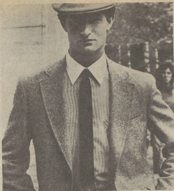
IN THE GREAT AMERICAN CHRISTMAS TRADITION... Van Heusen's '417' dress shirt. A crisp white collar perks a refined classic stripe in blue and tan, pink and grey, navy and chocolate brown. The traditional collar... 3 inches. Plus more traditional detailing... an authentic back pleat. A '417' shirt that will number among Santa's favorites.

You can make this holiday gift-giving season an authentically American one, with shirts that are a part of our heritage.