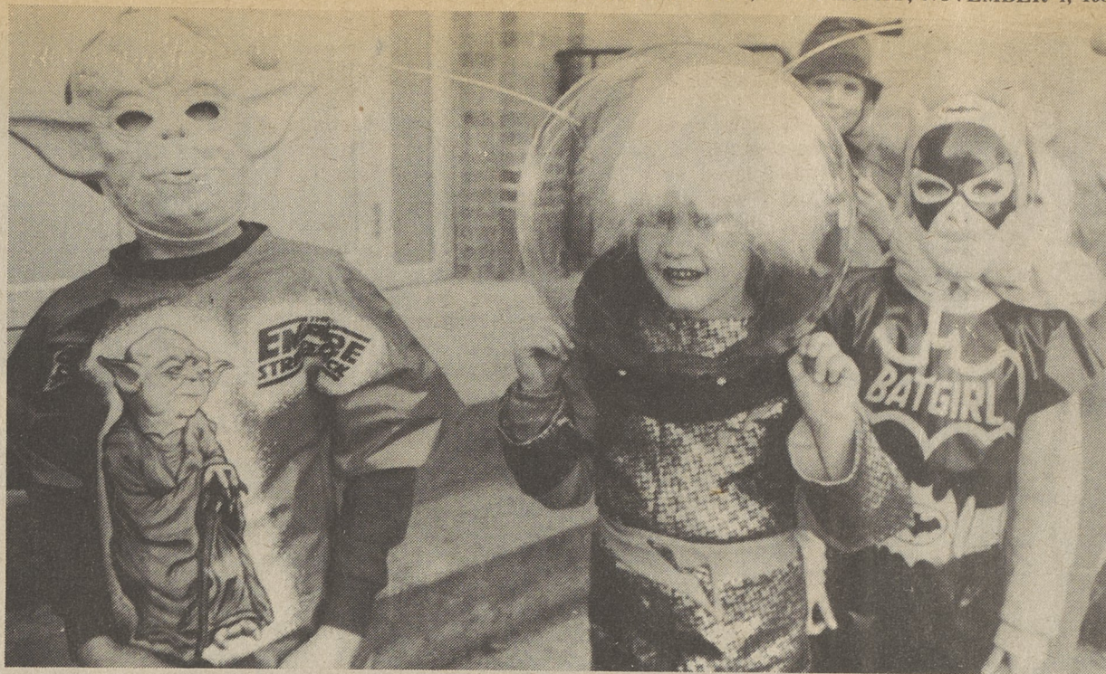
FRIENDS OR FOES —It was difficult to tell whether inhabitants from outer space or some of the Super Seven dropped in at Trucksville Elementary last week as the children came to their school party representing some of each. Martians, deep sea divers, Bat Girl, they all were there.