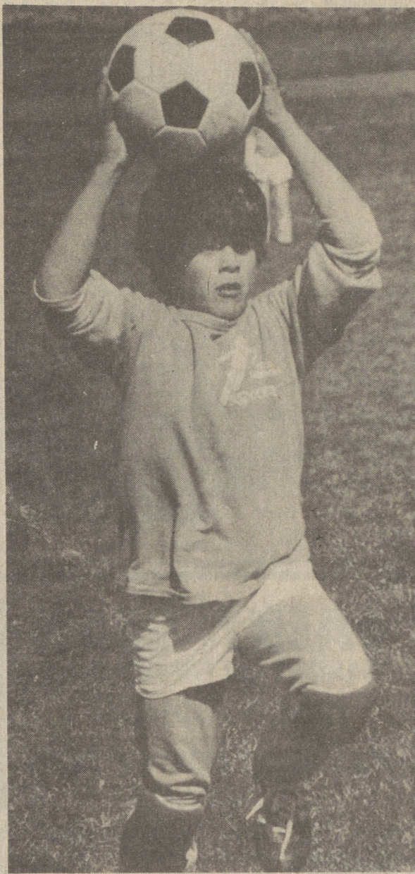
Back Mountain Youth Soccer player prepares to throw ball in for play at action at the Intermediate School last Saturday.