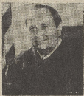
Paid for by: Judge Lemmond for Judge Committee