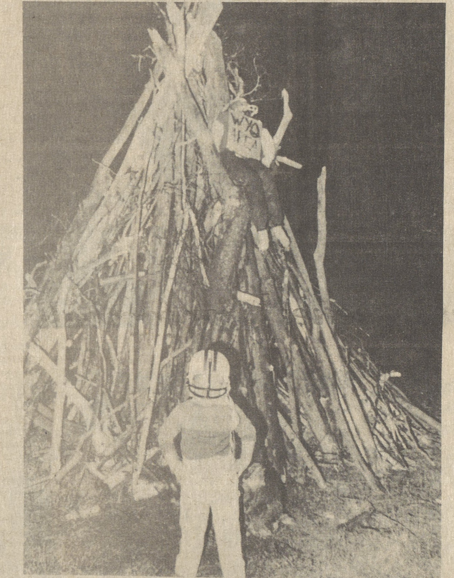
THE LITTLE GUY above is ready to take on any Wyoming Warrior at the Dallas bonfire last Friday night where the Mountaineers burned a Warrior in effigy.