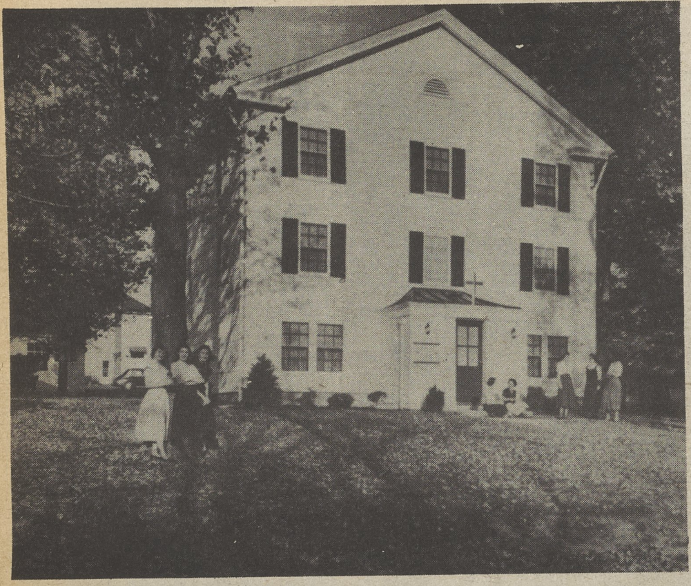
College Misericordia's Rosary Hall, opened in 1949. First floor was the home economics practice house; second and third floors, residence halls.