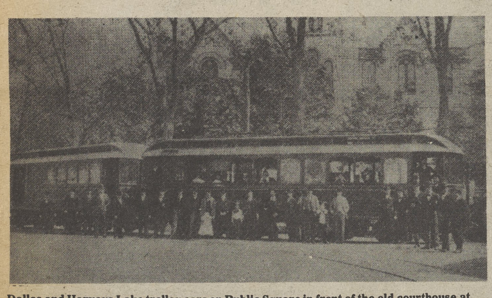
Dallas and Harveys Lake trolley cars on Public Square in front of the old courthouse at the turn of the century did a heavy business. Note the baggage car at the left.