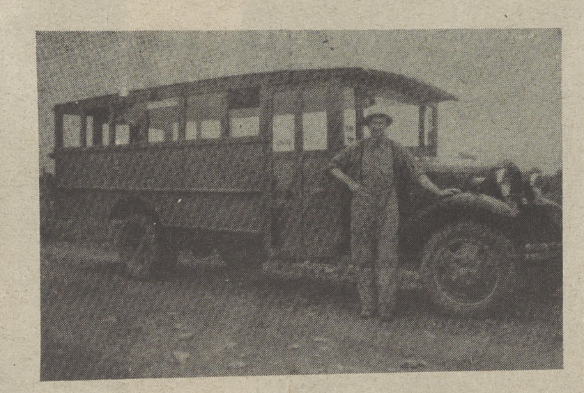
The bus shown above was driven by Russell Ide in 1936, transportating passengers in the Back Mountain.