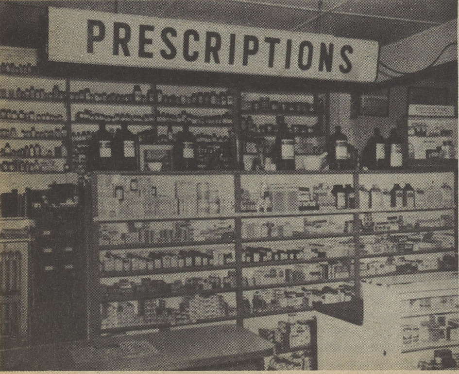
Prescription Department of the former Sheldon Evans Pharmacy, now the home of Cook's Drug Store in Shavertown.