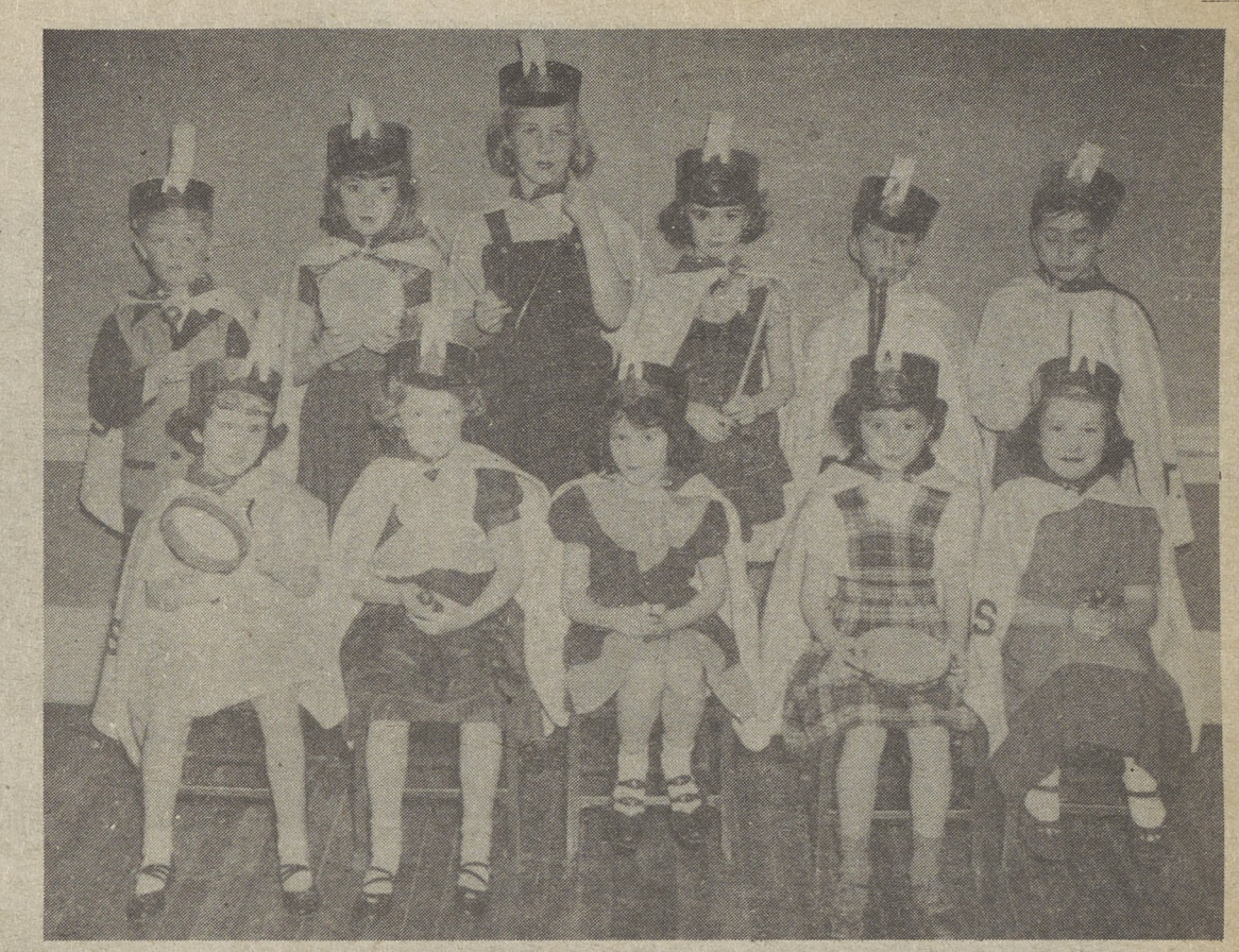
One of the early rhythm bands of the Dallas Elementary School. Person who contributed the photo was unable to identify those in the picture.