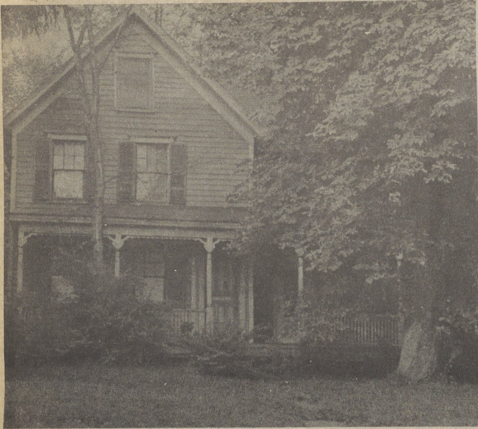
One of the old homes located in the Dallas area but no one was able to identify to whom it belonged. The Post welcomes identification.