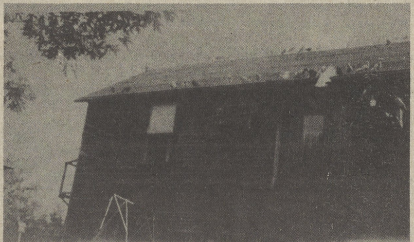
W.G. Moss raised homing pigeons in his barn in Trucksville and many of them are shown as they return home. The photo was taken in 1939.