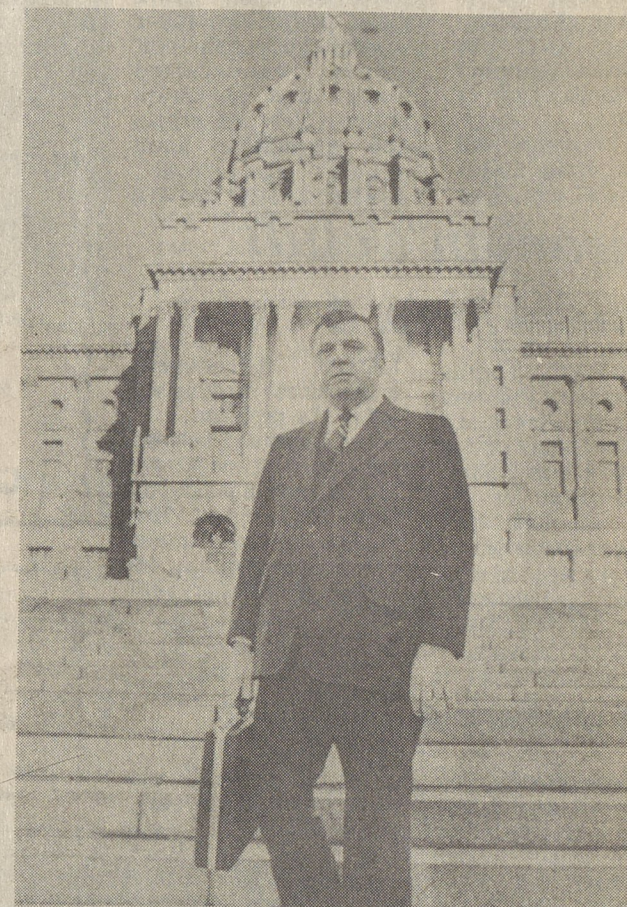
Photo License & Emission Control.