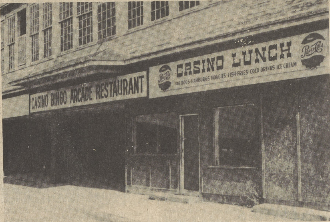
CASINO RAZED --The Casino at Harvey's Lake at one time was the entertainment center for the Sunset area. Bingo games were held downstairs while dances were going on up stairs. Various restaurants came and went in the front portion of the building along with game rooms. But with time comes age and the building has become an eye sore which will be torn down.

The next pack meeting for Pack 281 only, will be held on Friday, Oct. 24 at 7:30 p.m. at the United Methodist Church of Dallas.