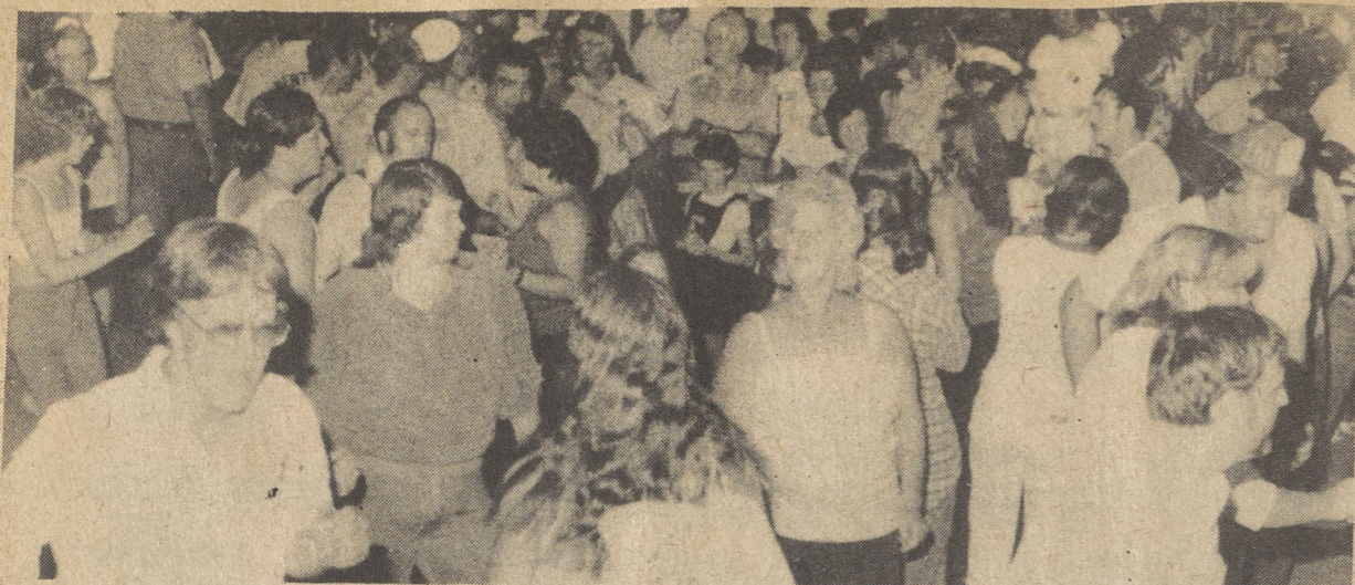
ABILENE ATTRACTS--Large numbers turned out to Country Carnival. Young and old alike enjoyed the dance to the music of Abilene last Sunday night at the rhythm of the popular group.