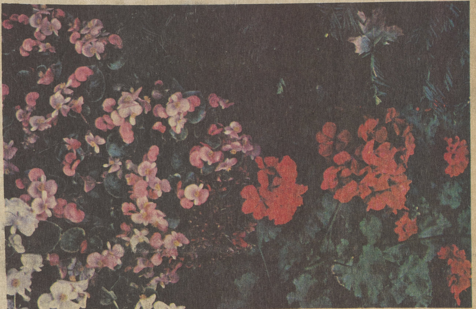
FLOWERS BEAUTIFUL—Bright red and white flowers mixed with bright green greet visitors as they enter the center of Dallas. The

Hoblak reported that the ranking PennDOT official, when asked about repaving and guardrails, merely "smiled."