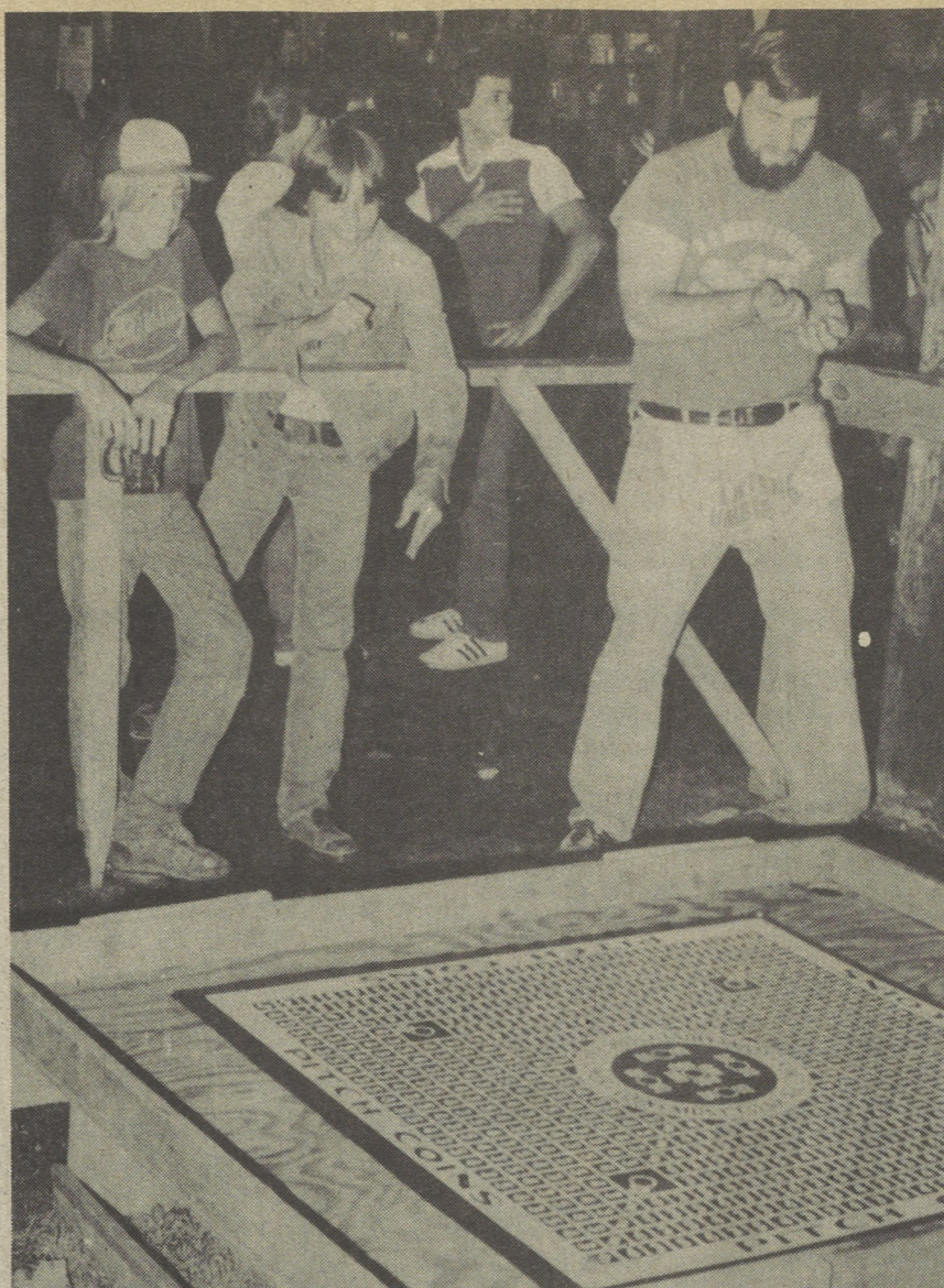
HOPING —These two youngsters pitch coins in the hopes of winning a prize at the Harveys Lake Firemen's Bazaar last weekend.