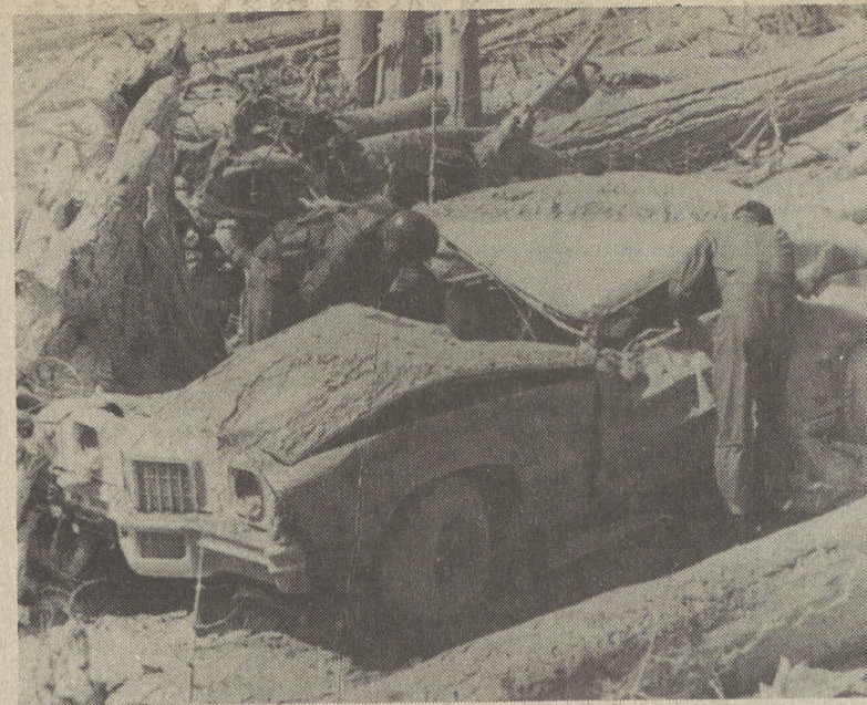
LOOKING FOR SURVIVORS—Two members of the 3-5th Cavalry's Aero-Scouts inspect a damaged vehicle for signs of life.

Martin intends to get out of the service and go to truck driver's school.